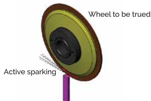
DIA-TRUpin placed in front of center line

A Diamond or CBN wheel dressed in this manner is ready for grinding and does not need any extra sharpening or conditioning.